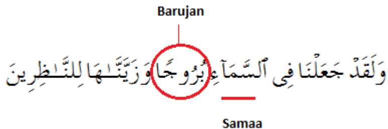
Illustration - Joseph Islam

"And verily in the Heavens ( Arabic: Samaa ) We have setup great constellations / mansion of the stars ( Arabic: Barujan ) and beautified it for the beholders"